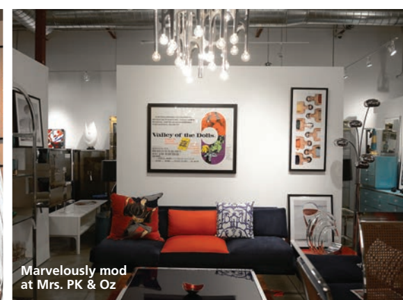
Marvelously mod at Mrs. PK & Oz