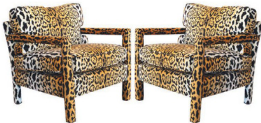
Walk On The Wild Side With Leopard Chairs! Oh So Classic!