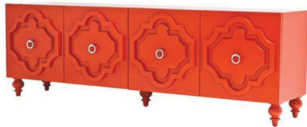
Go Bold—With A Pop Of Color. Make It Count!

» She possesses a flair of her own and a confidence to match; in turn, the client finds comfort in her knowledge and precision when it comes to selection, taste and balance.