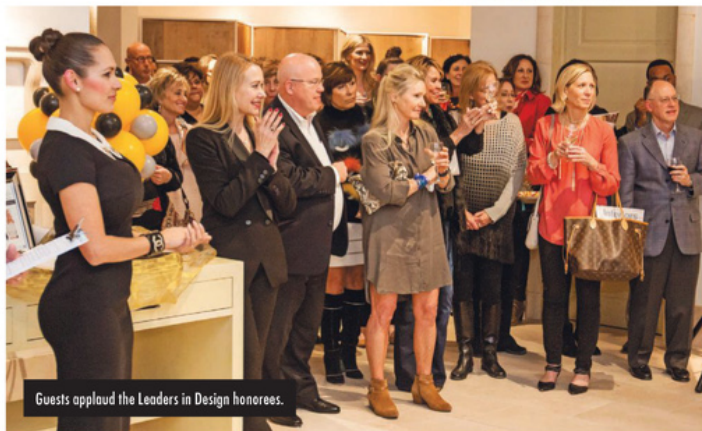
Guests applaud the Leaders in Design honorees.