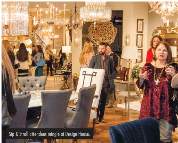
Sip &amp; Stroll attendees mingle at Design House.