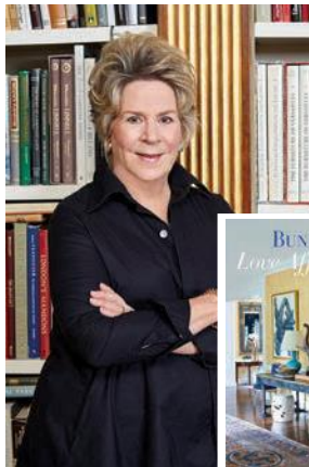
Bunny Williams, Speaker and Design Awards Judge

For Texas Design Week Houston schedule, go to texasdesignweek.com ; inquiries, tapvents@texasdesignweek.com .